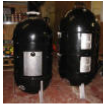
Standing next to a WSM