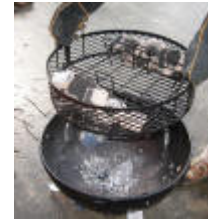
Divided Charcoal basket with handles

If any of you have used one of ProQ's Smokers, Let Us Know About Your Experience!